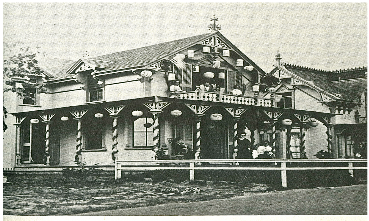
Cottage bedecked for Illumination, Oak Bluffs.

Maybe this will turn into a regular revival of the Hall as a performance venue?